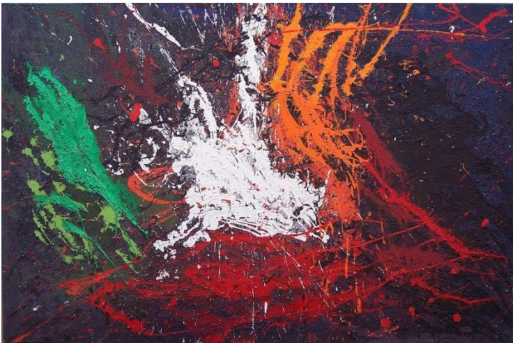
Figure 1 - Ardoyne

Samples of Brian's compelling and thought provoking art: