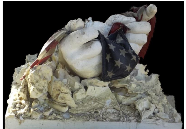
Figure 2 - Never Forget