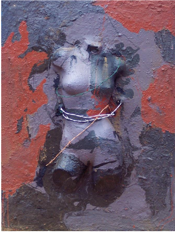
Figure 5 - Peaceline