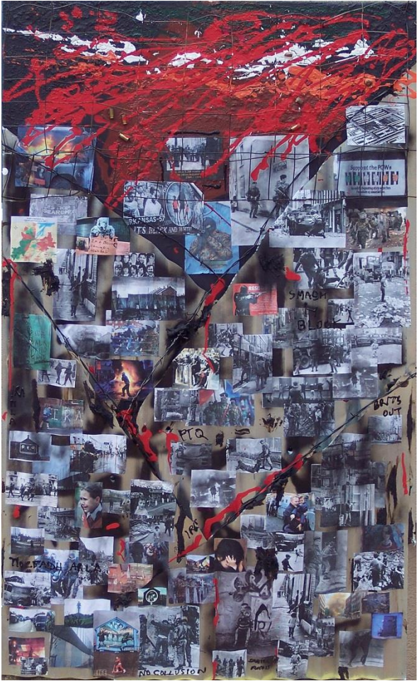
Figure 4 - Burn